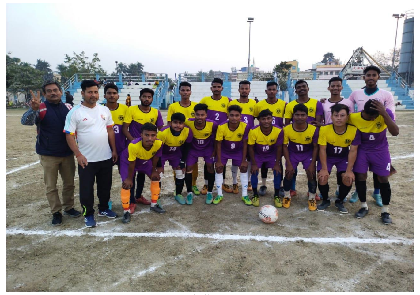
Football (Men) Team